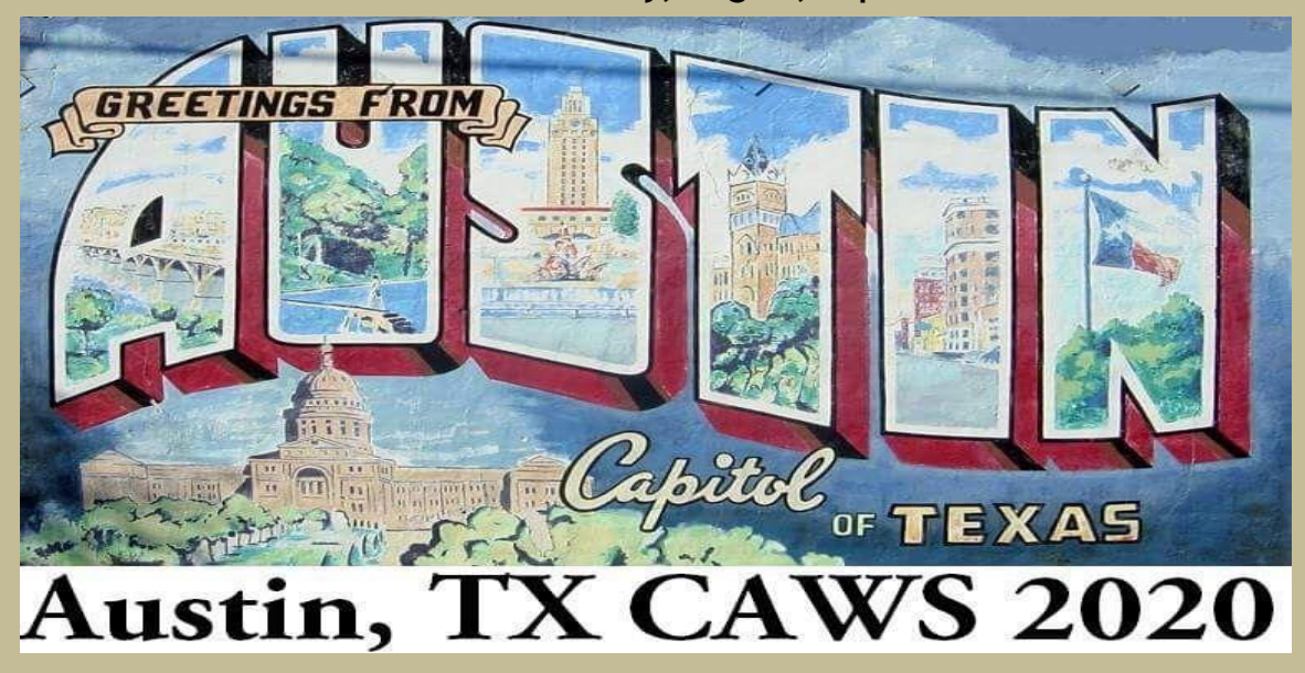
Fall 2019 - July, August, September

The 2020 World Convention Steering and General Committees are excited about the plans and how well they are coming along for our convention on May 21-25, 2020 at the Hyatt Regency in Austin, Texas.