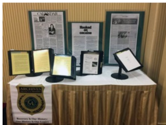
HISTORICAL FLIP BOOKS

https://museum.ca.org/wp-content/uploads/downloads/CAWS-History-2022.pdf