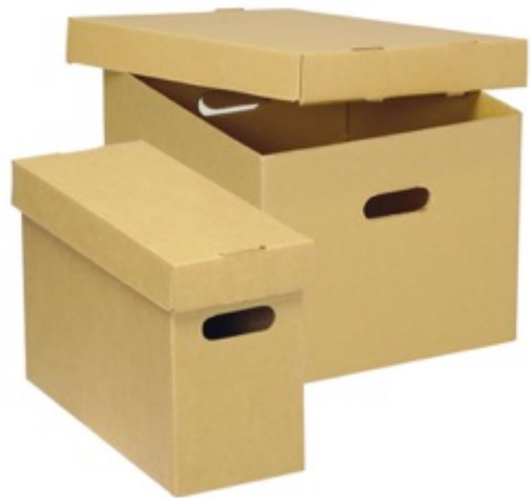
ACID-FREE DOCUMENT STORAGE BOXES