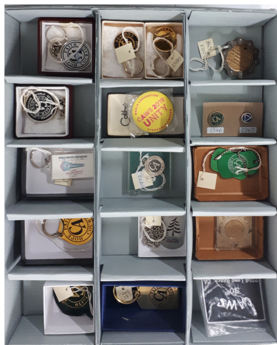
SMALL OBJECTS BOX