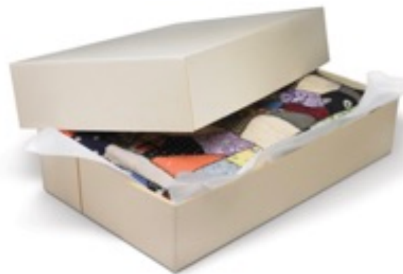
ACID-FREE TEXTILE STORAGE BOX

Dangers to all textiles include: light (both artificial and daylight), dirt, dampness, insects, and excessive heat.