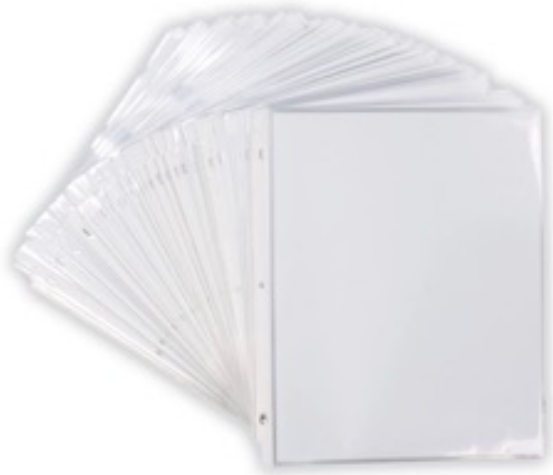
MYLAR SLEEVES FOR PULP DOCUMENTS